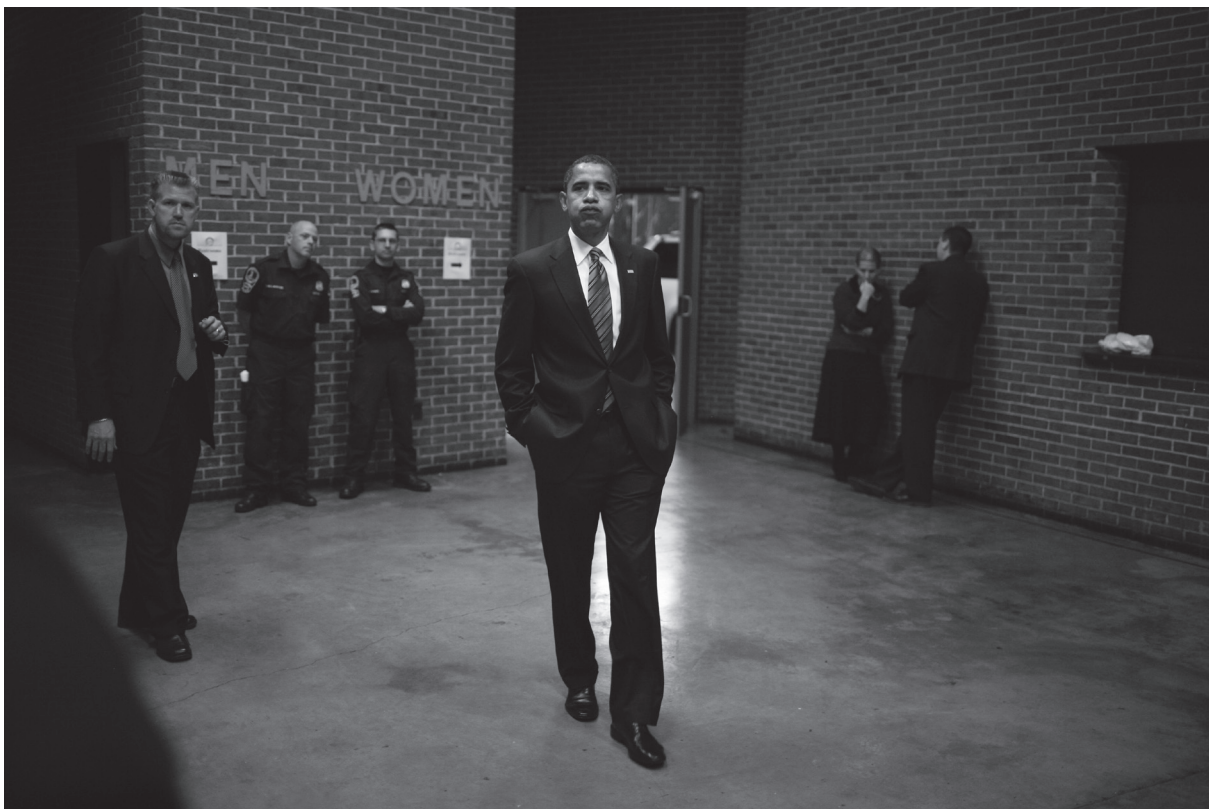
Mr. Obama waited backstage before an October campaign rally at the Richmond Coliseum in Richmond, Va.