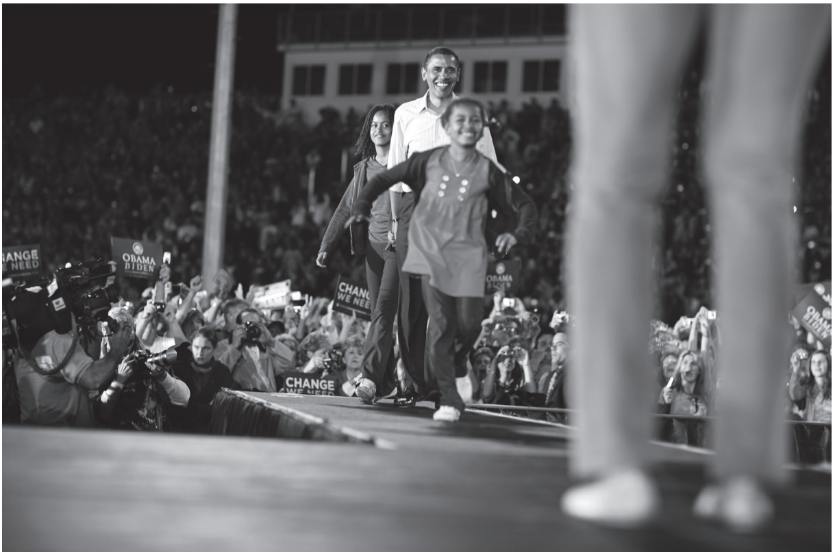
Mr. Obama and daughters Sasha and Malia joined his wife Michelle at a November campaign rally in Springfield, Mo.