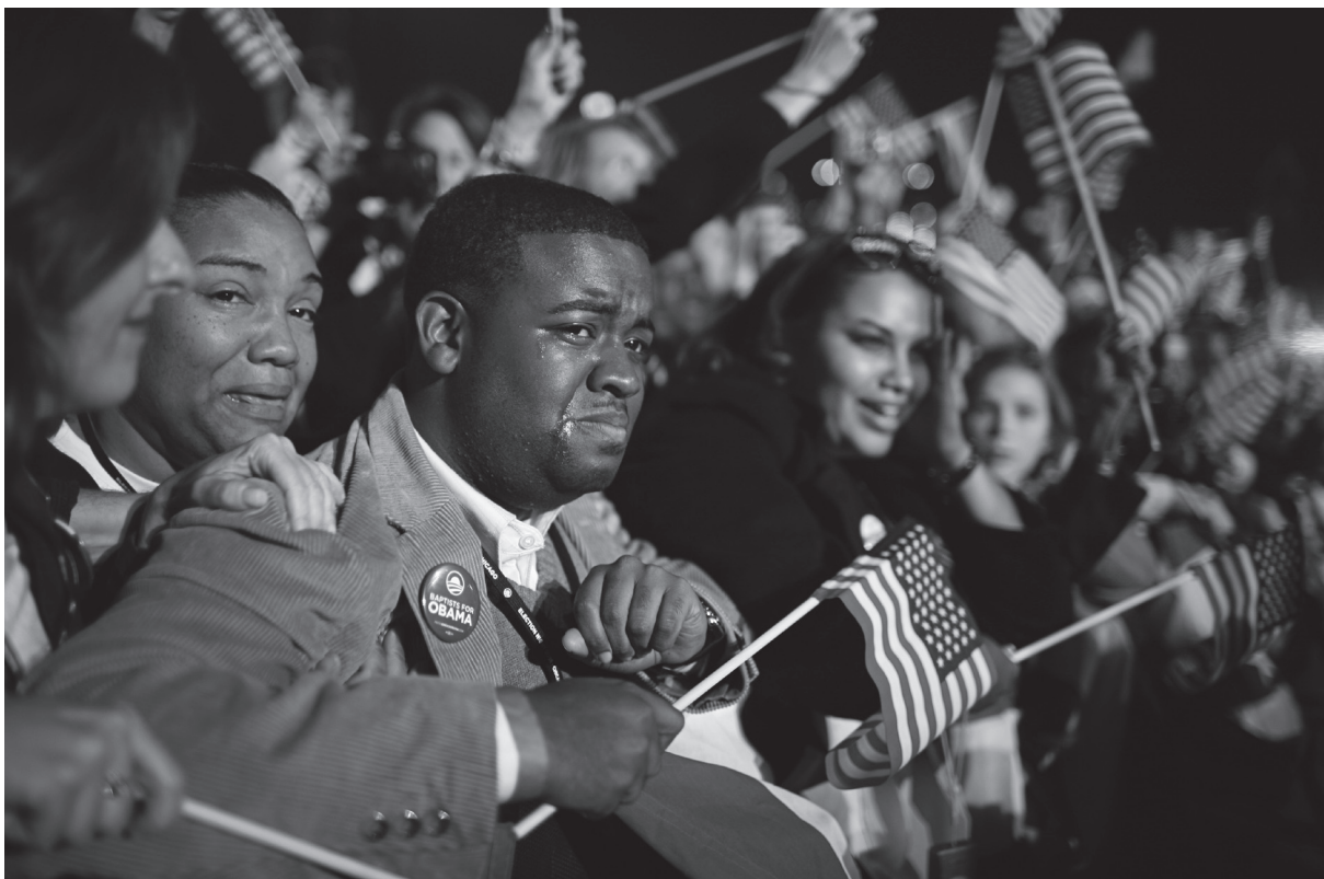
Supporters cried and cheered on election night in Grant Park in Chicago as it became certain that Mr. Obama would be the next president.