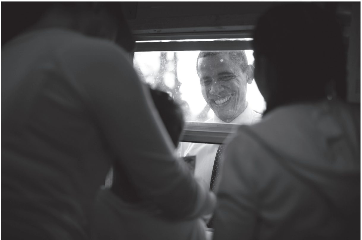
Mr. Obama bought tickets for food and rides at the Sombrero Festival in Brownsville, Tex., in February.