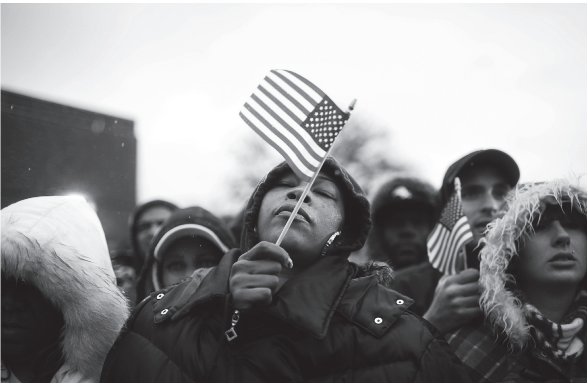
Supporters waited for hours and endured freezing rain to see Mr. Obama at an outdoor rally in Chester, Pa., in October 2008.