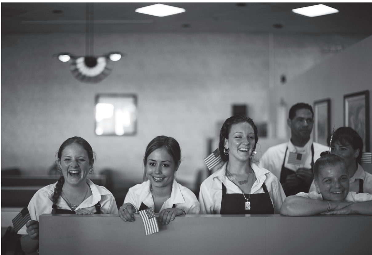
The serving staff watched from the back as Mr. Obama greeted customers and workers at the Deli Den in Fort Lauderdale, Fla., in October.