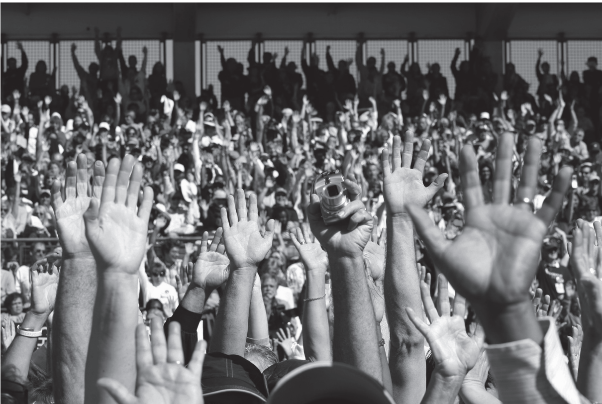
A show of hands an October rally at Ed Smith Stadium in Sarasota, Fla.: Who makes under $250,000 a year, Mr. Obama asked?