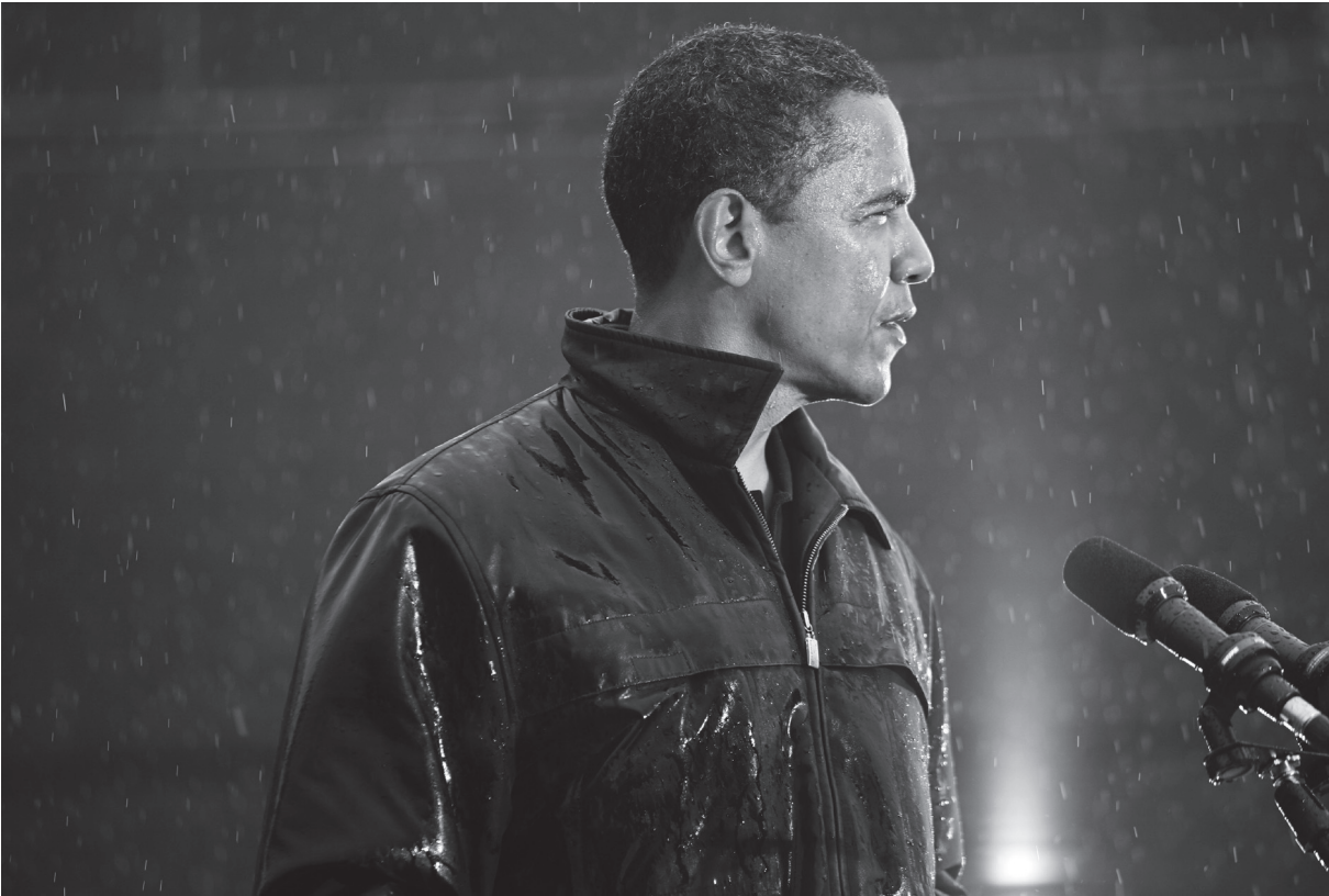
Mr. Obama continued speaking despite heavy rain at a campaign rally at Widener University in Chester, Pa, the week before the presidential election.