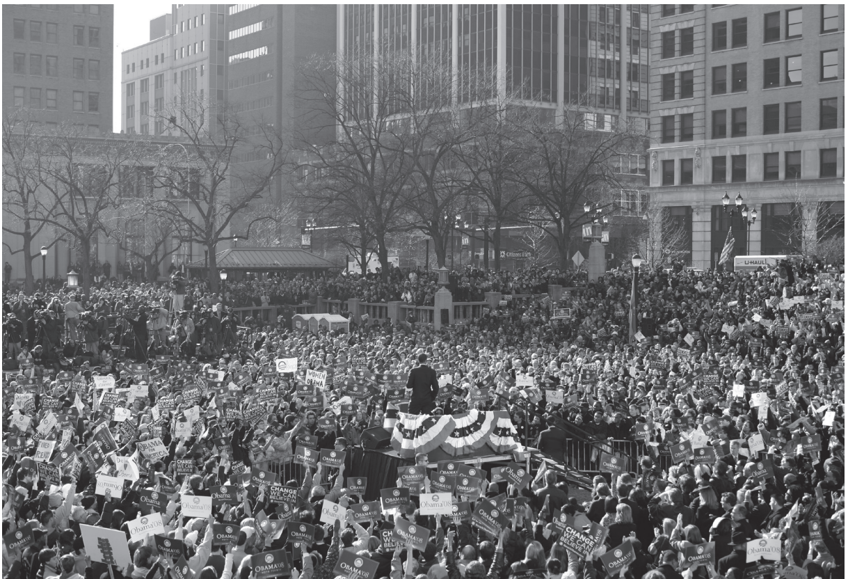
Mr. Obama addressed a February rally in Rodney Square in downtown Wilmington, Del.