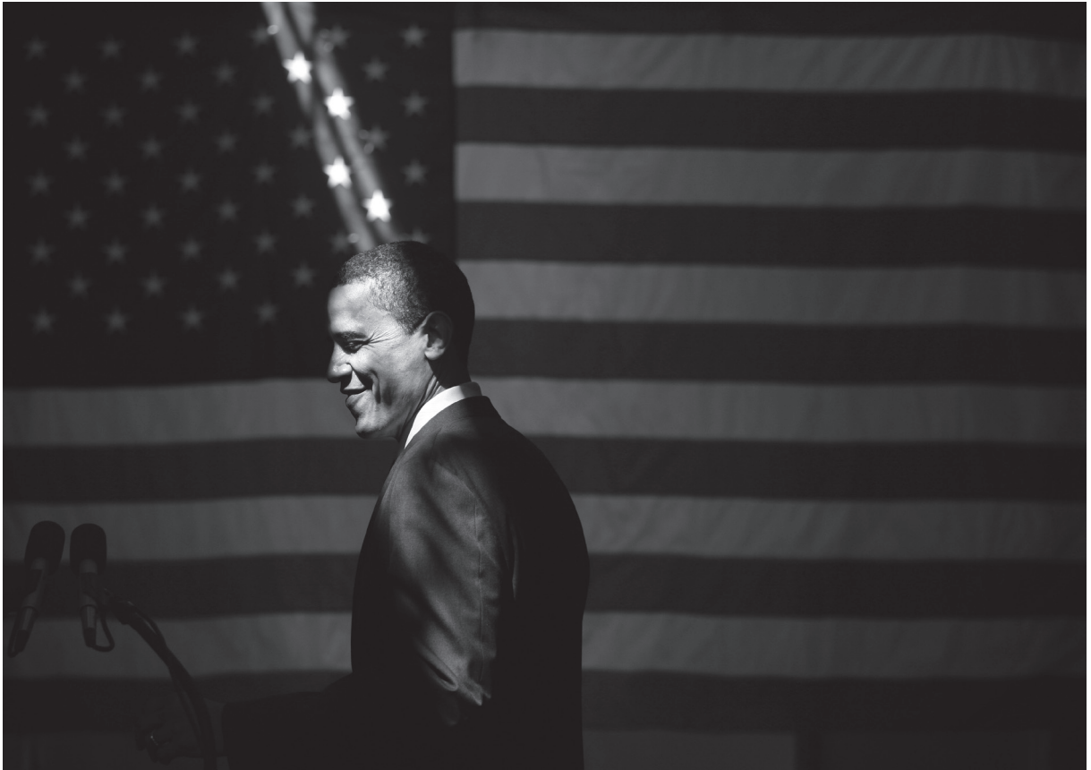
Mr. Obama after a meeting with veterans in San Antonio in March.