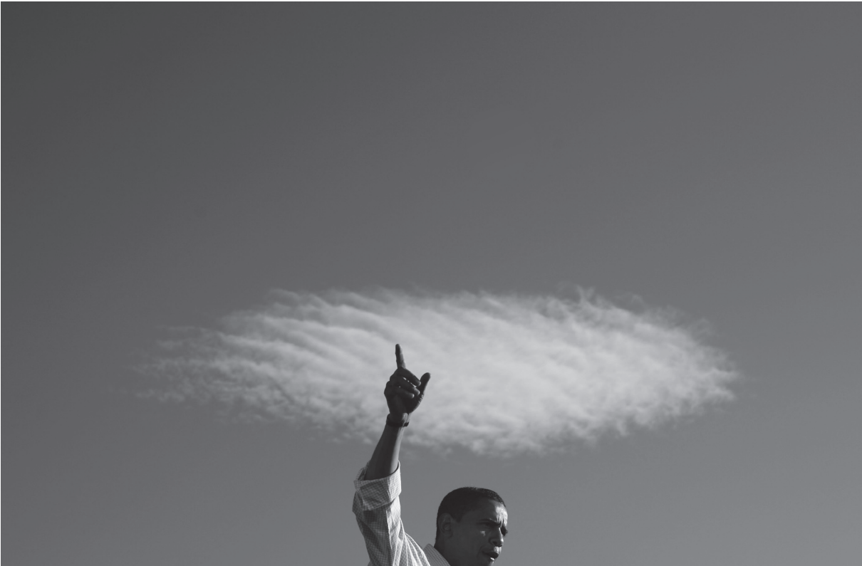
Mr. Obama at a campaign rally in Pueblo, Colo., the Saturday before the election.