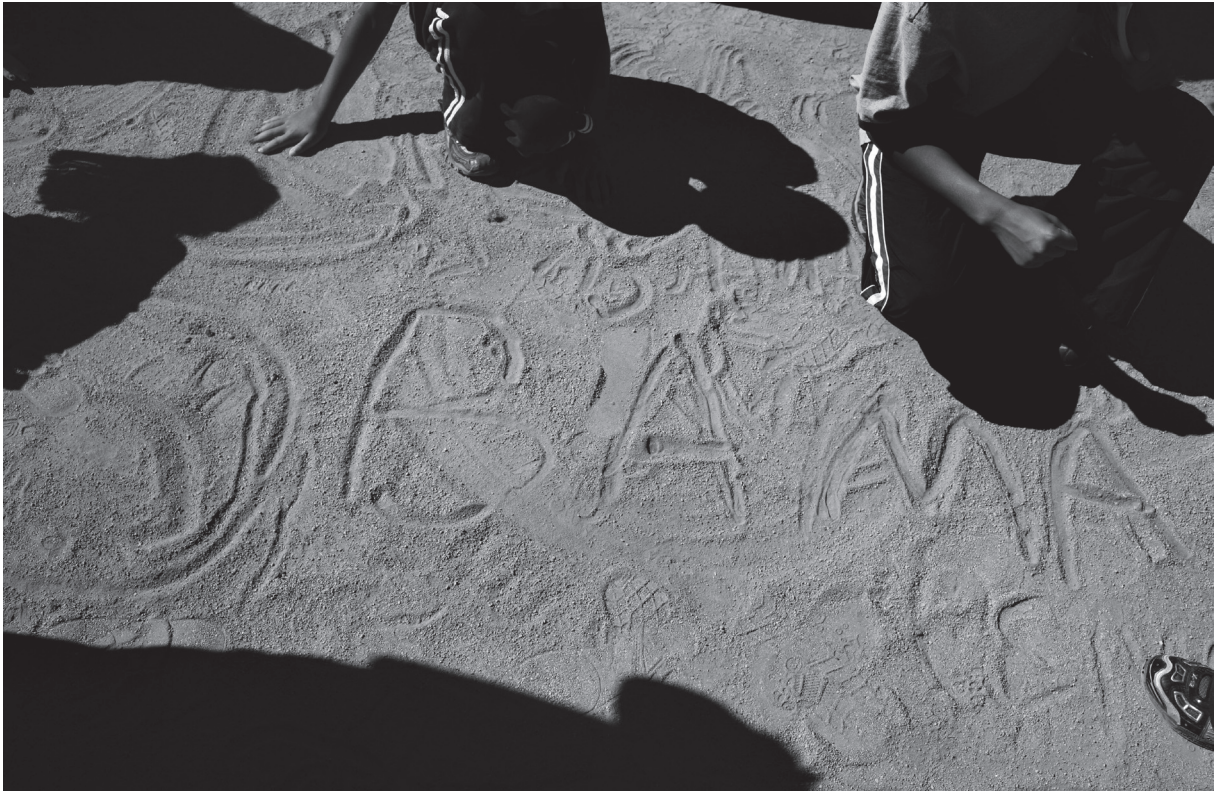
Children inscribed a favorite at an October Obama rally at Ed Smith Stadium in Sarasota, Fla.