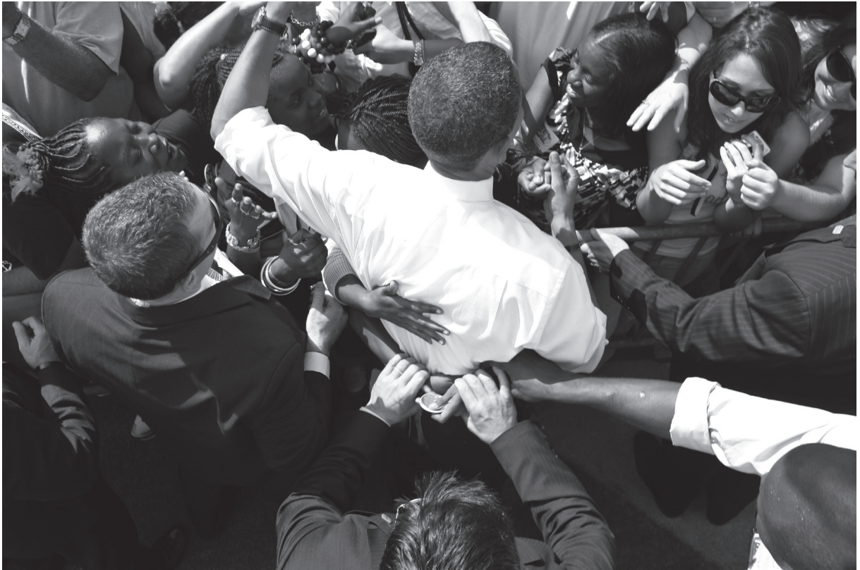
Secret Service agents tugged at the hands of a supporter as she hugged Mr. Obama in October at Legend's Field in Tampa, Fla.