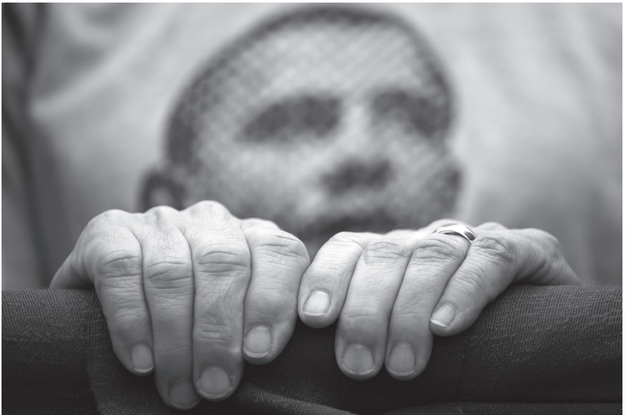
A mid-October campaign stop at Mack's Apples in Londonderry, N.H.