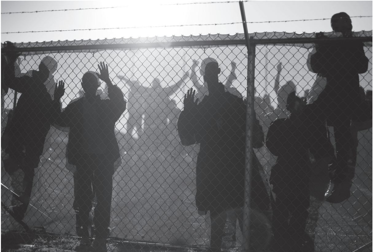
Students cheered from behind a fence on the school track as Mr. Obama arrived to speak to an overflow crowd before a town hall at Duncanville High School in Texas in February 2008.