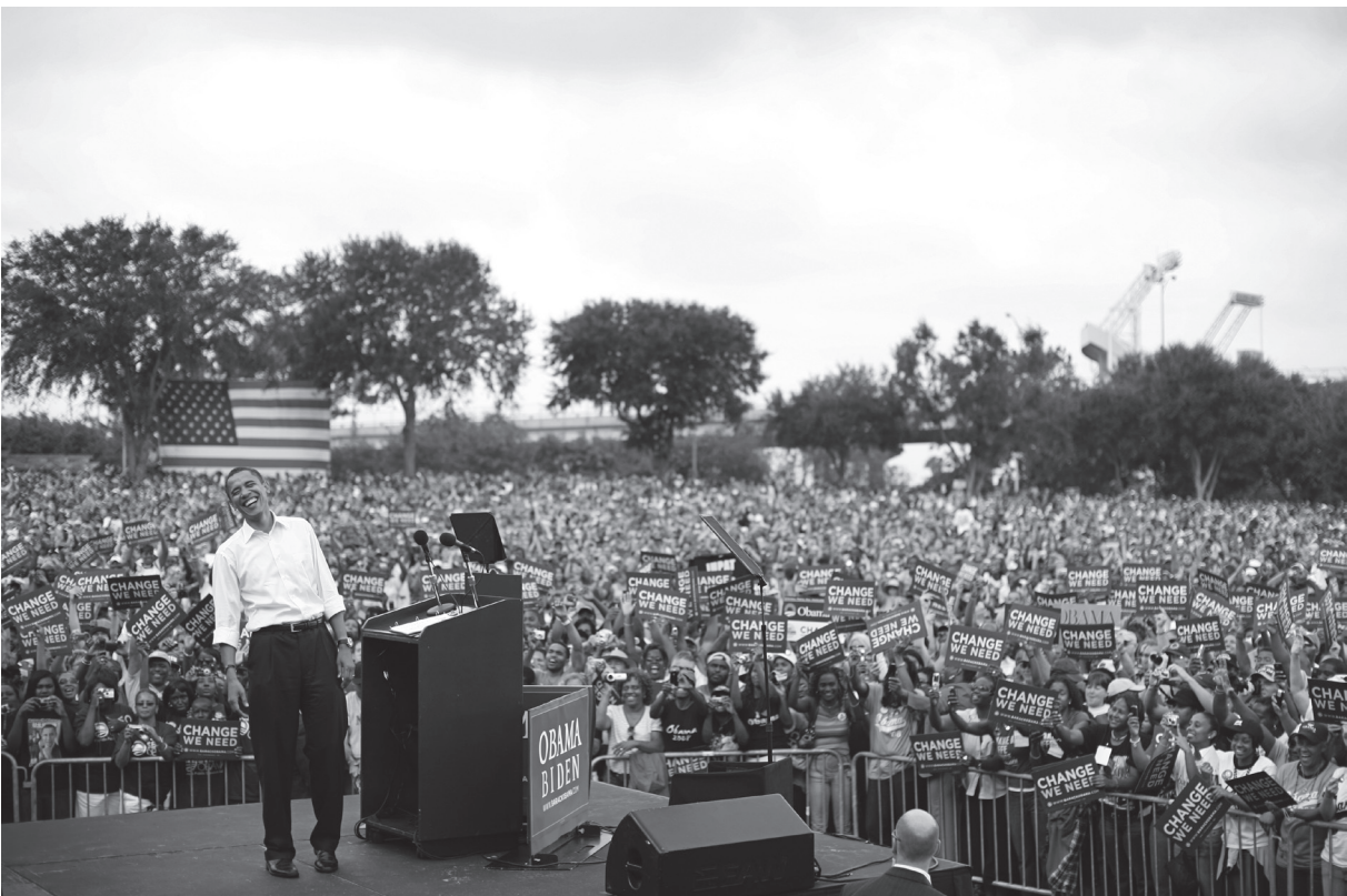
Not all was serious or momentous at a September Obama rally in Jacksonville, Fla.