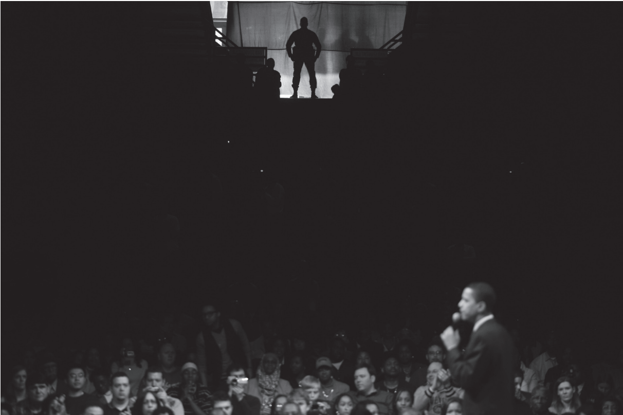
A law enforcement agent kept watch from an upper level entrance as Mr. Obama spoke at a January rally at Bartow Arena at the University of Alabama.