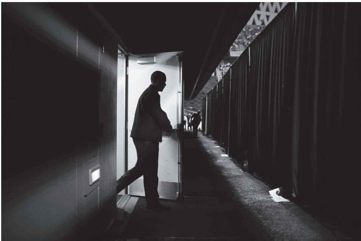
Mr. Obama emerged from a holding area backstage before a November rally at the University of Cincinnati.